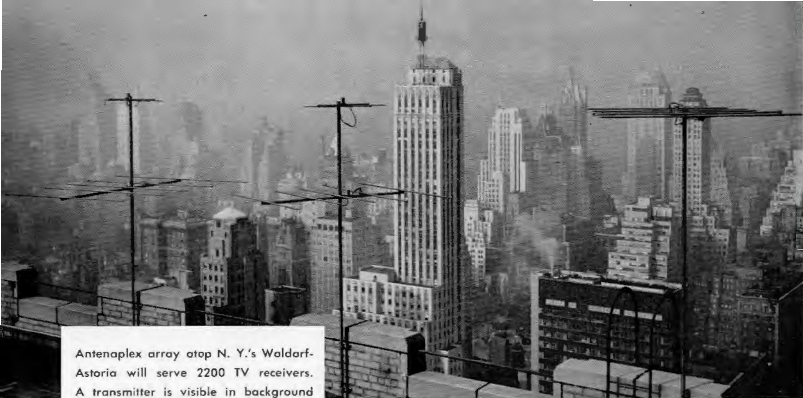
Antenaplex array atop N. Y.'s Waldorf-Astoria will serve 2200 TV receivers. A transmitter is visible in background