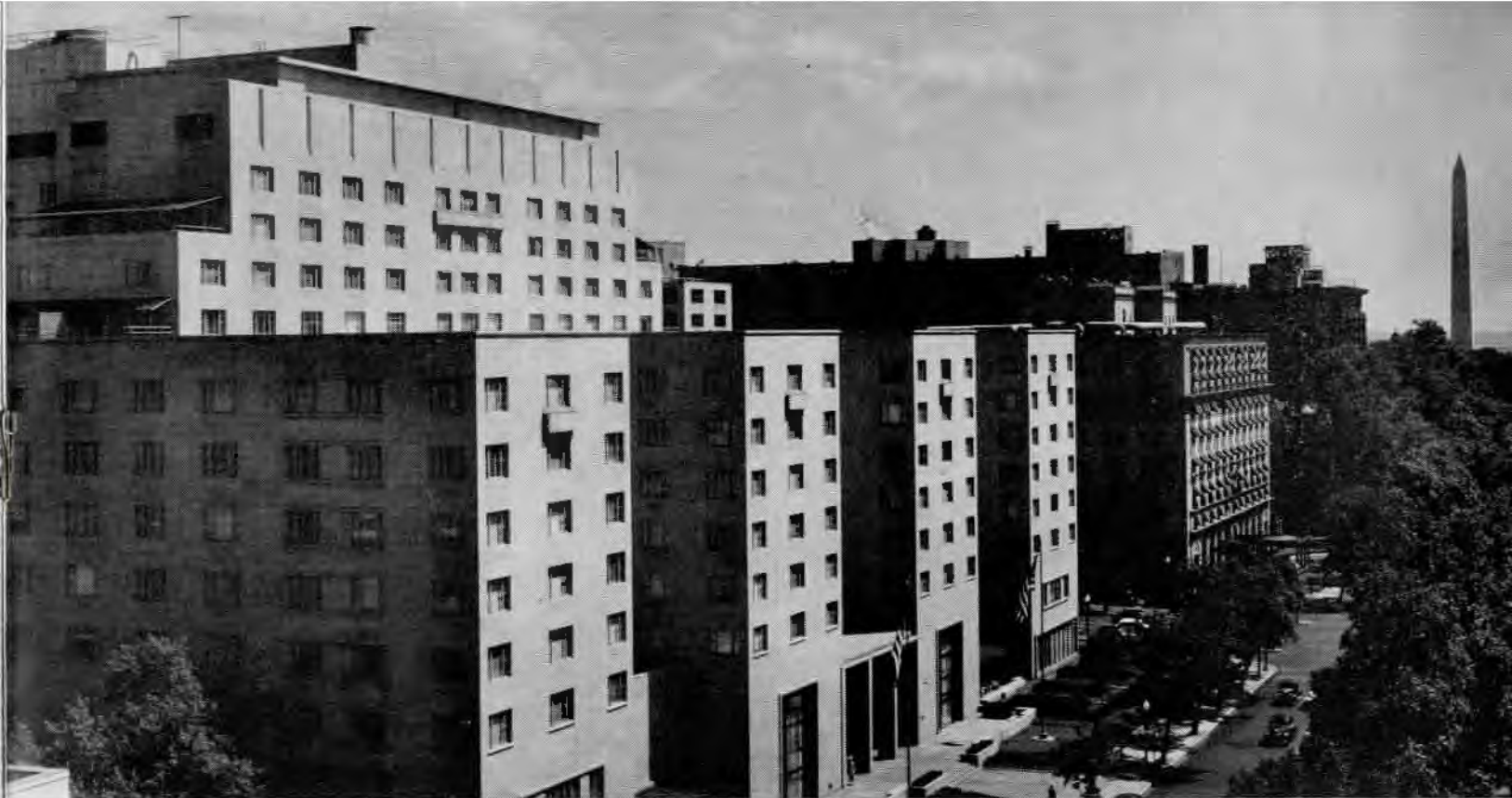
1000-EYED ANTENAPLEX brings pictures to every guest in Washington's new Hotel Statler. (System completed Sept. 30).

and a network of coaxial cable, strung over poles through the areas served. Signals are stepped up by amplifiers, mounted at intervals on the poles, and are brought to subscribers via lead-off lines. Today, there are nearly 2000 users.