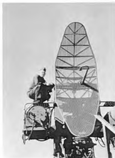
Government field engineer Jack Crawford (l.) checks out equipment at radar site in North Africa. (At right, top photo) FE Henry Sawyer skirts overcast at 9,600 feet over the Alps. (At right) is street scene in Athens, Greece, near where Government personnel are stationed