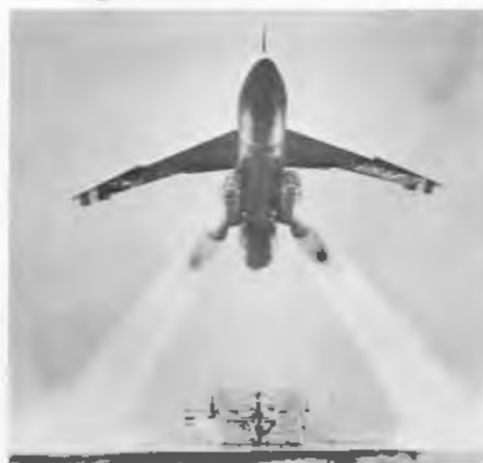
The SNARK Missile . . . its range is in excess of 5,000 miles

"This is but one of the series of major operations which this Center must support with equal facility in the months to come, if we are to fulfill our responsibility to the Department of Defense. The success of the Range in this important test greatly strengthens my conviction that AFMTC will be equal to the challenges of the future."