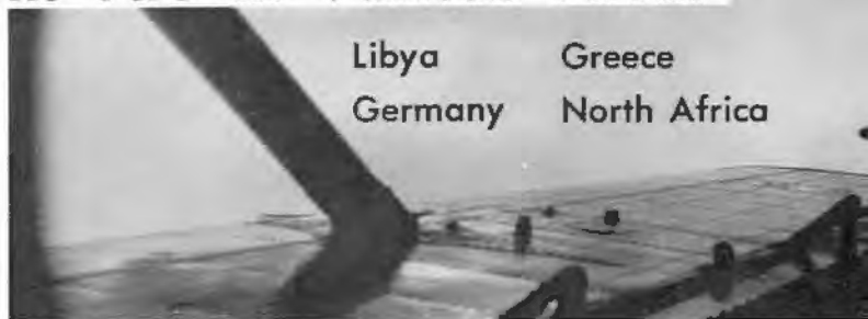
Libya Greece Germany North Africa