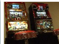
Marvel and Speed 1