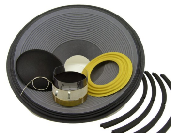
Speaker Recone Kit