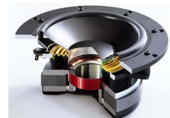
SS Audio Speaker Repair Kits

Inside! Easy to use instructions for SS Audio speaker recone kits